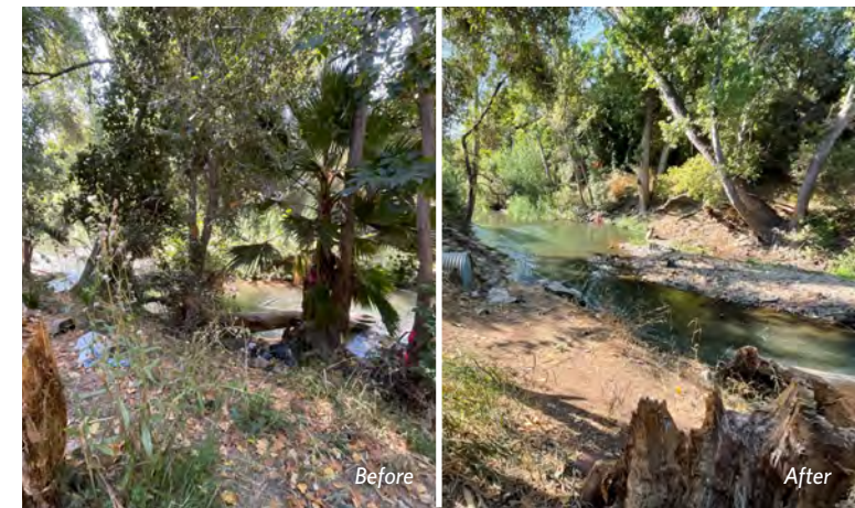
Vegetation was removed from the east bank of Guadalupe River downstream of Coleman Avenue in San José to restore the stream's design flow conveyance capacity.