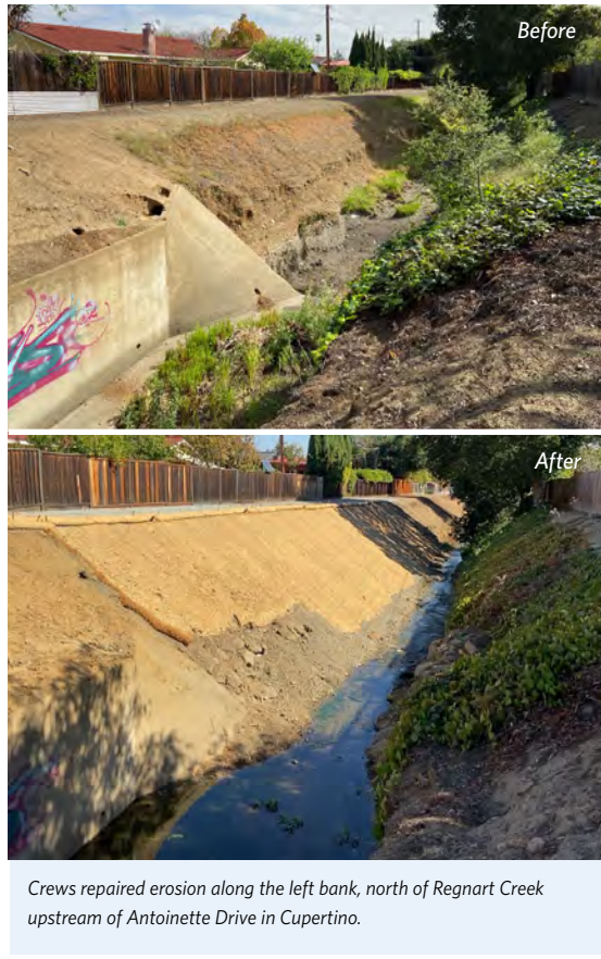
Crews repaired erosion along the left bank, north of Regnart Creek upstream of Antoinette Drive in Cupertino.